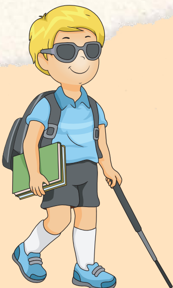
Graphic Description- A schoolboy wearing black glasses is walking with a cane in his left hand. He is carrying a school bag and holding two books in his right hand.

We hope you enjoy reading the ninth edition of HIVE 2022.